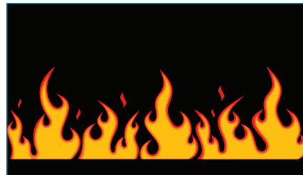
Research Showing More Links Between Inflammation & Cancer p.36